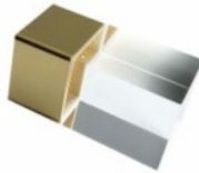
DCU02 ACRYLIC FINIAL