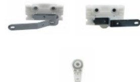
PINCH PLEAT COMPONENTS [WHITE OR BLACK]