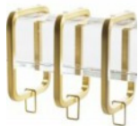
DCU30 METAL RING