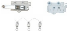
RIPPLEFOLD COMPONENTS [WHITE] SPECIFY FULLNESS 60%, 80%, 100%, 120% OVERLAP OR BUTTMASTER